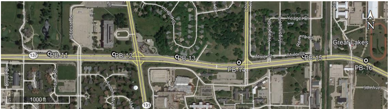
Exhibit 5) Approximate locations of borings along Section 4