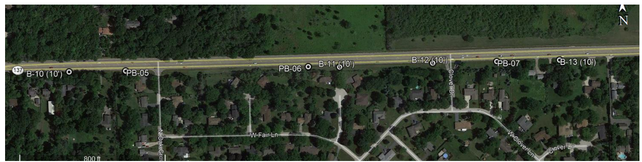
Exhibit 3) Approximate locations of borings along Section 1