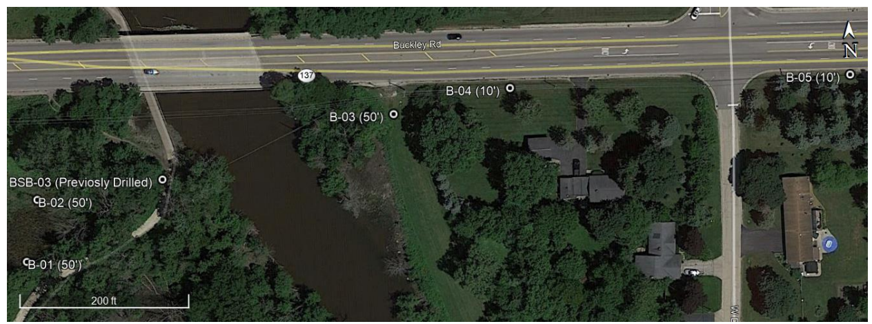
Exhibit 1) Approximate locations of borings near Des Plaines River

The approximate proposed boring locations are shown below. Rubino recommends that the borings be located and surveyed for elevation by others prior to drilling. If the borings cannot be surveyed, Rubino will locate the borings in the field by measuring distances from known, fixed site features.