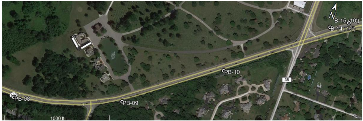
Exhibit 4) Approximate locations of borings along Section 1