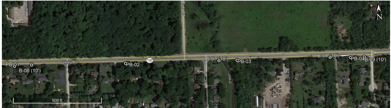
Exhibit 2) Approximate locations of borings along Section 1