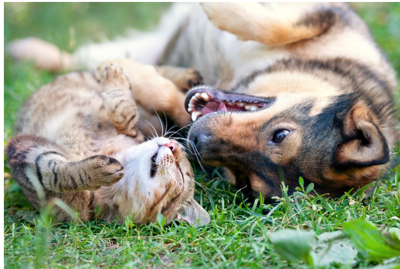
Lake County, Illinois