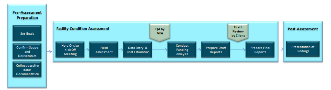
Figure 1 Accruent's assessment process has been refined and proven through the assessment of more than 4 billion square feet of assets under management.

Accruent provides consistent, reliable data and transparent, easy-to-follow program management advice that will enable you to effectively and efficiently manage your facility capital program. Figure 1 shows Accruent's process for conducting facility assessments and providing deliverables that enable customers to more effectively manage their asset portfolios.