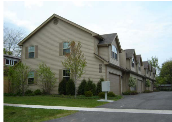
After: Affordable homes for 6 families, paid <$26,000 in 2015 property taxes