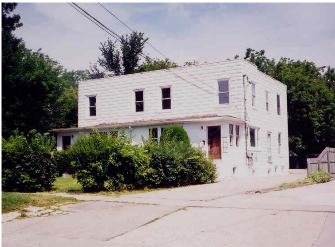
Before: Vacant, tax delinquent, crack house, condemned, foreclosed