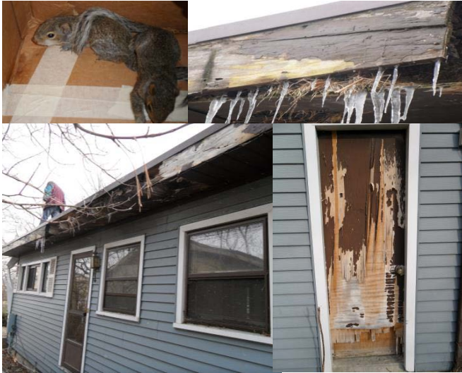
Before: Vacant, uninhabitable