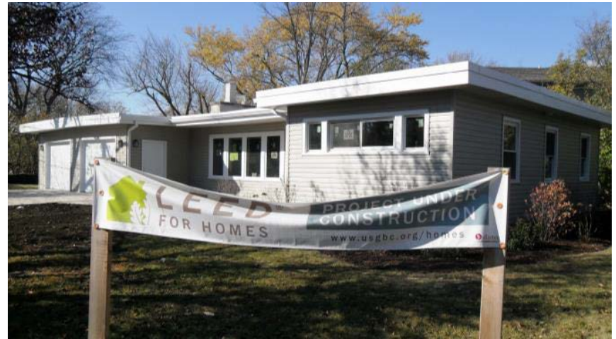
After: LEED Certified, home for young family of four