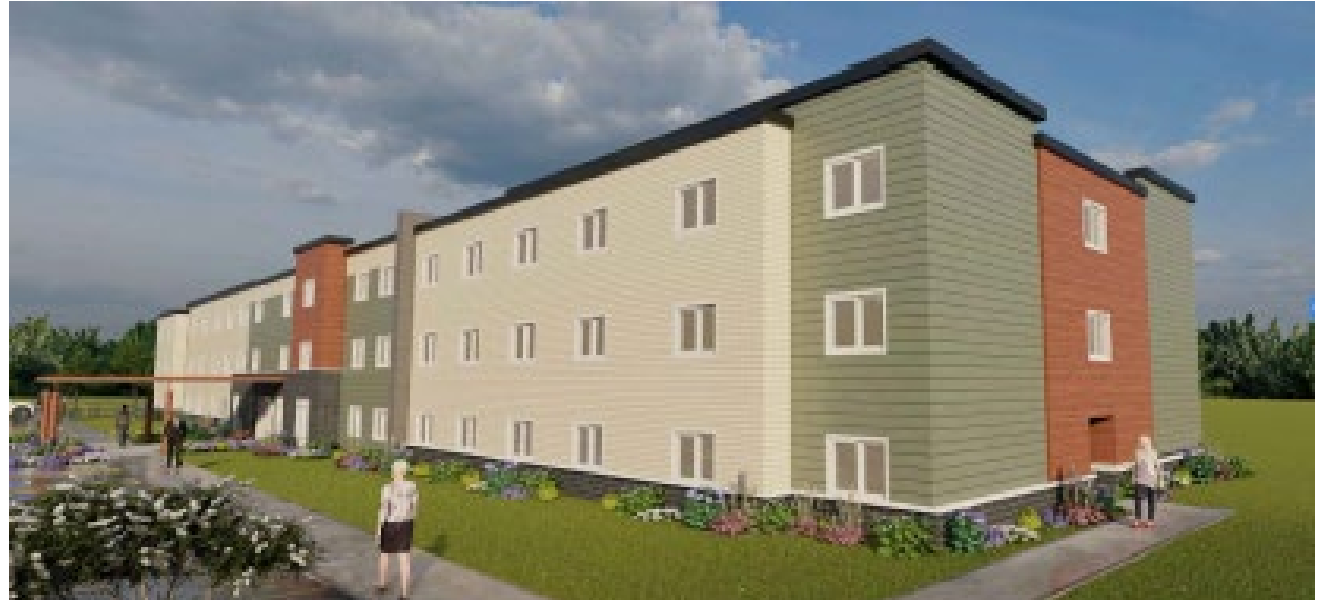
Rendering of Beech Street Senior Lofts in Island Lake