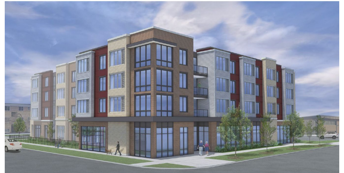
Rendering of Mundelein Senior Apartments, currently under construction