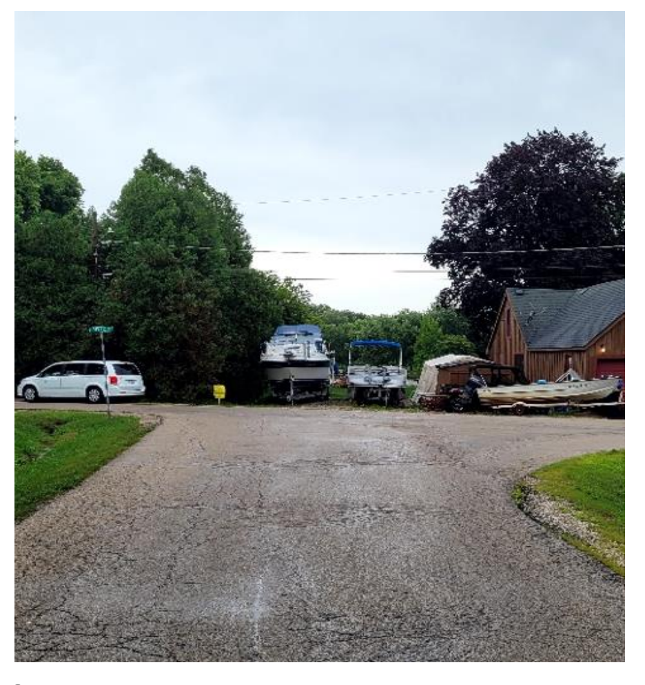
Midway Street – Looking East