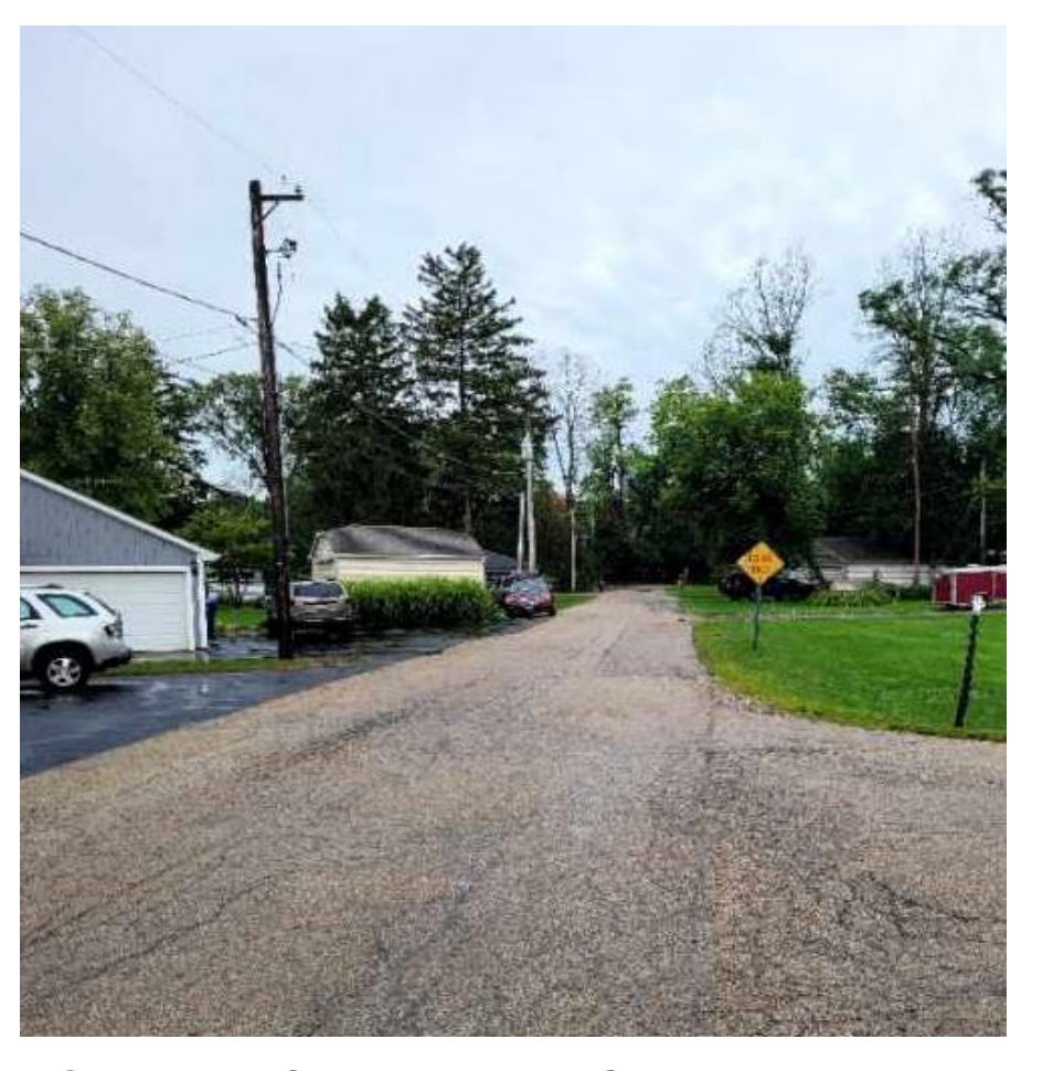
Midway Street and River Road – Looking South