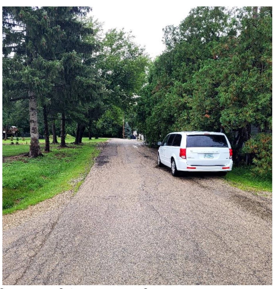
Midway Street and River Road – Looking North