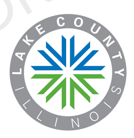
Lake County, Illinois