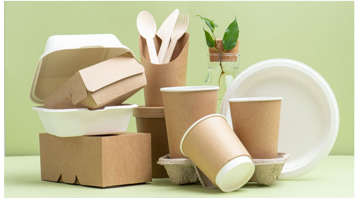
Fig 2. Pile of Compostable Products from: Borg, K., Curtis, J., & Lindsay, J. (2020, June 23). Avoiding single-use plastic was becoming normal, until coronavirus. Here's how we can return to good habits. The Conversation. https://theconversation.com/avoiding-single-use-plastic-was-becoming-normal-until-coronavirus-heres-how-we-can-return-to-good-habits-140555