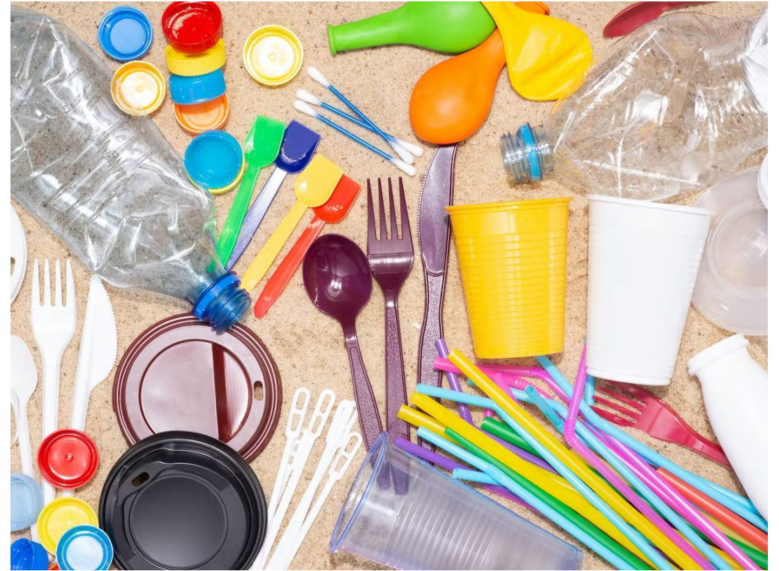
Fig 1. Pile of Single Use Plastics from: E. (2021, August 22). Are Compostable Products the Best

Choice? Earth911. https://earth911.com/business-policy/are-compostable-products-best-choice/