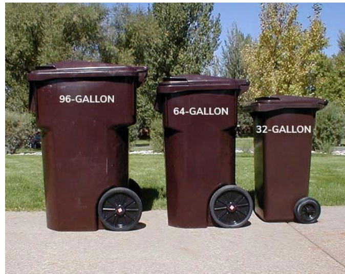
Fig 3. Size comparison of waste bins from: A. (2022, March 18). Residential .