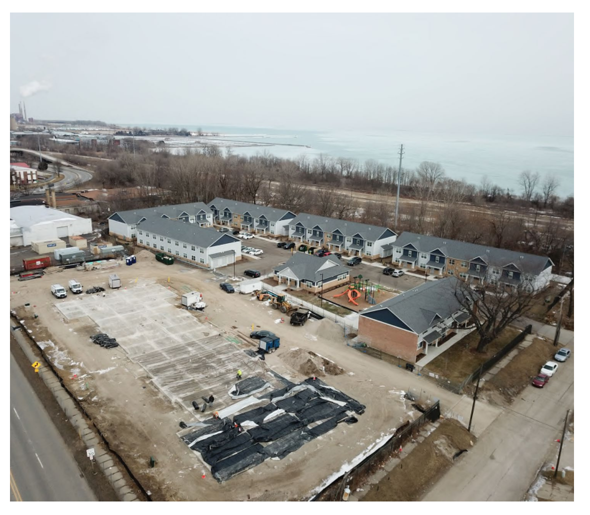
Barwell Manor Redevelopment in Waukegan