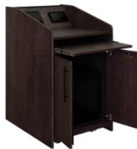
Back Open View