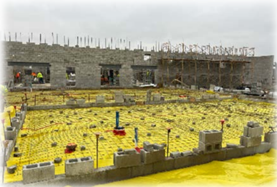
ROC Facility Construction