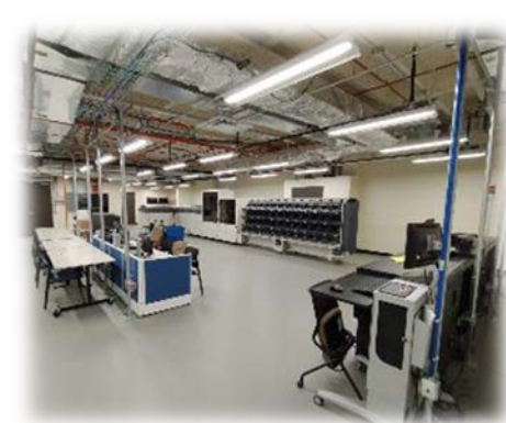
Vote By Mail Room