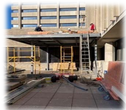
North Entrance & Lincoln Plaza Exit