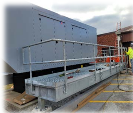
Depke Electrical Improvements