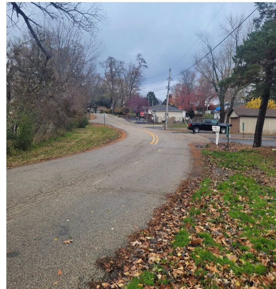
Drexel Blvd. – Looking North