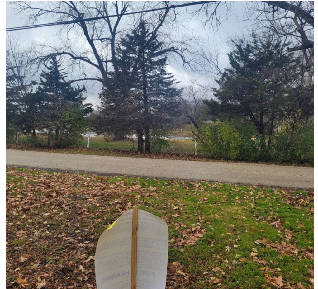
Drexel Blvd.– Looking West