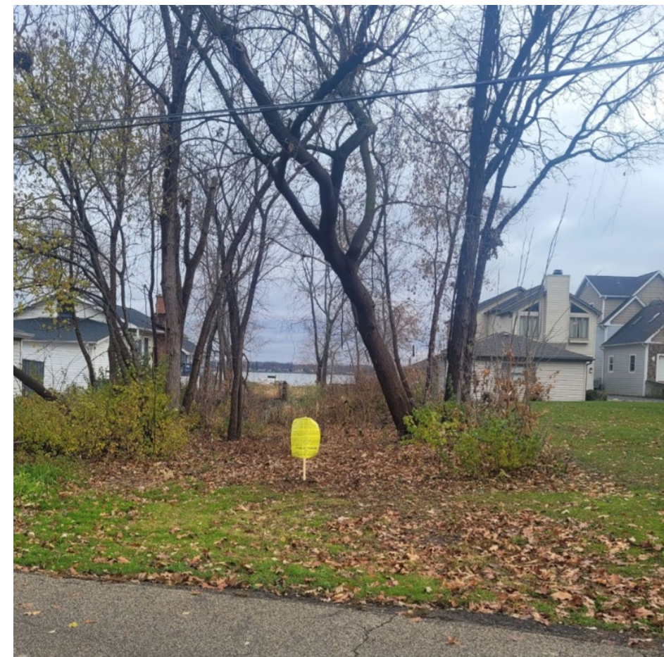
Drexel Blvd. – Looking East