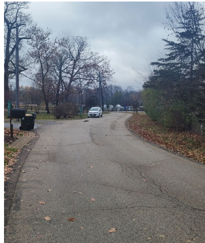
Drexel Blvd. – Looking South