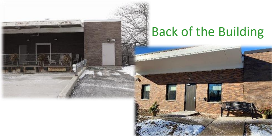
Back of the Building