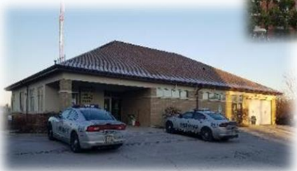
Consolidated Public Safety Building