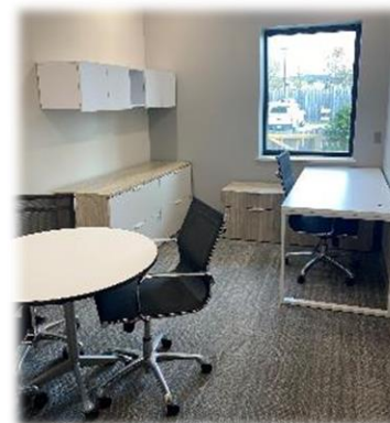
New Office Space