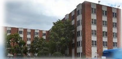
Winchester House Demolition