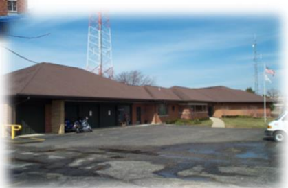
911 Dispatch/EOC/ETSB Center