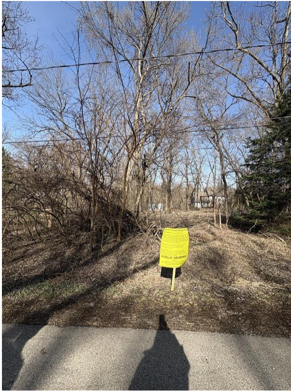
Dewey St – Looking Northwest