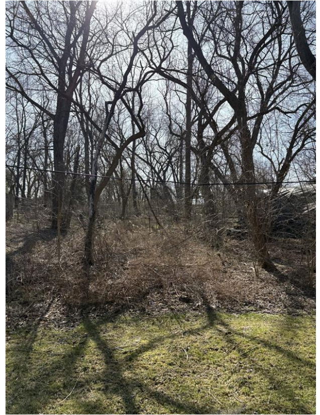
Lee Avenue – Utility Wire