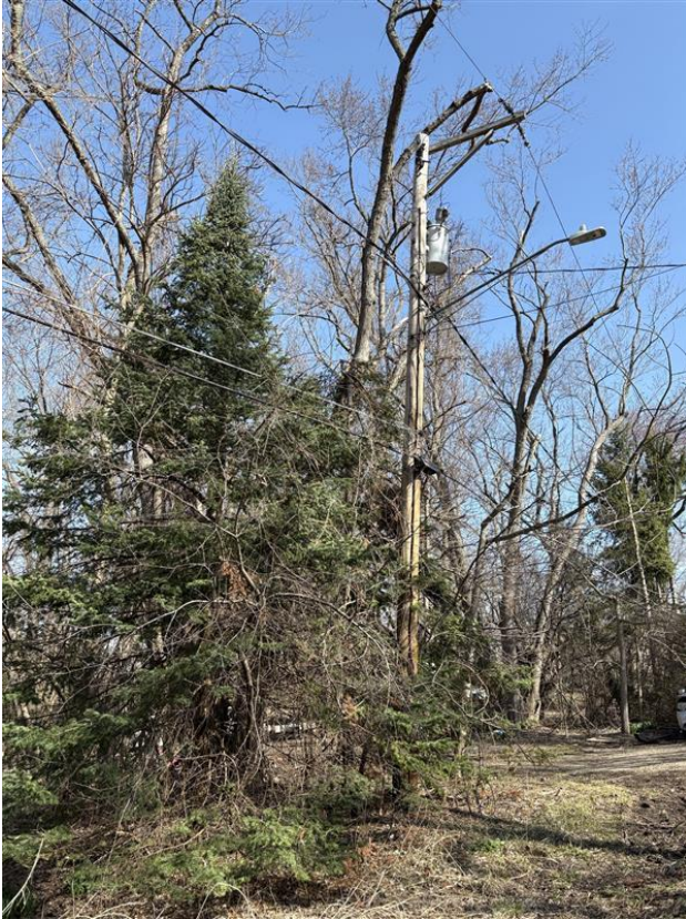
Dewey Street – Utility Pole Facing North