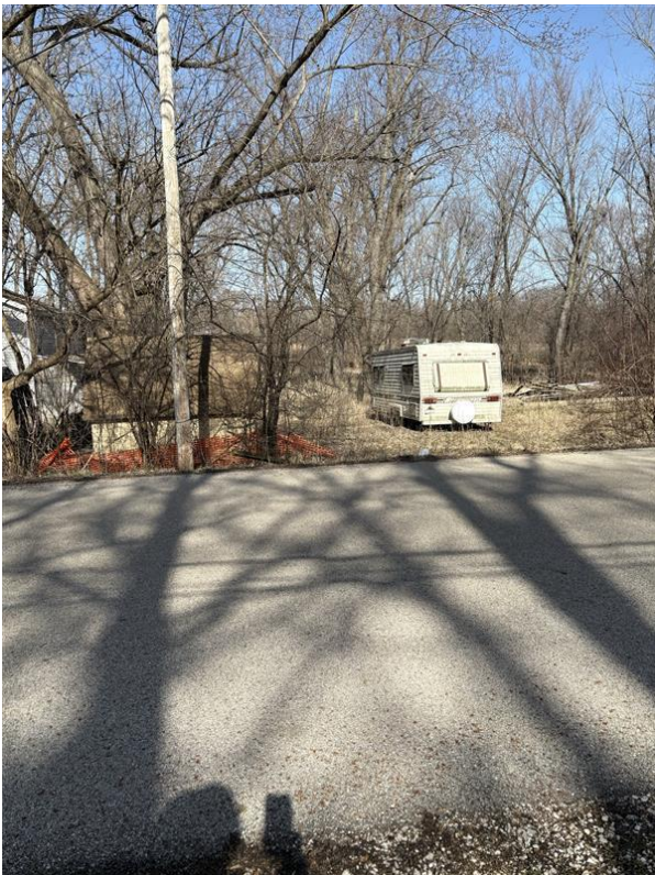
Lee Avenue – Facing Northwest