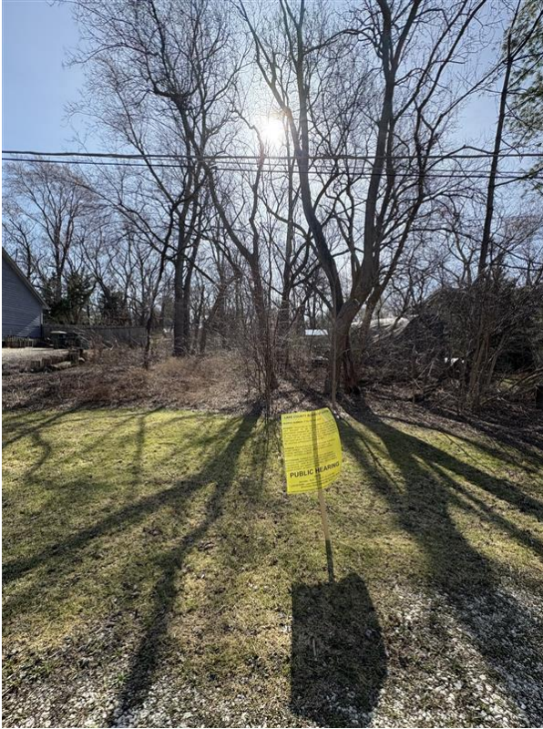
Lee Avenue – Facing Southeast