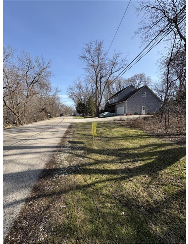
Lee Avenue – Facing Northeast