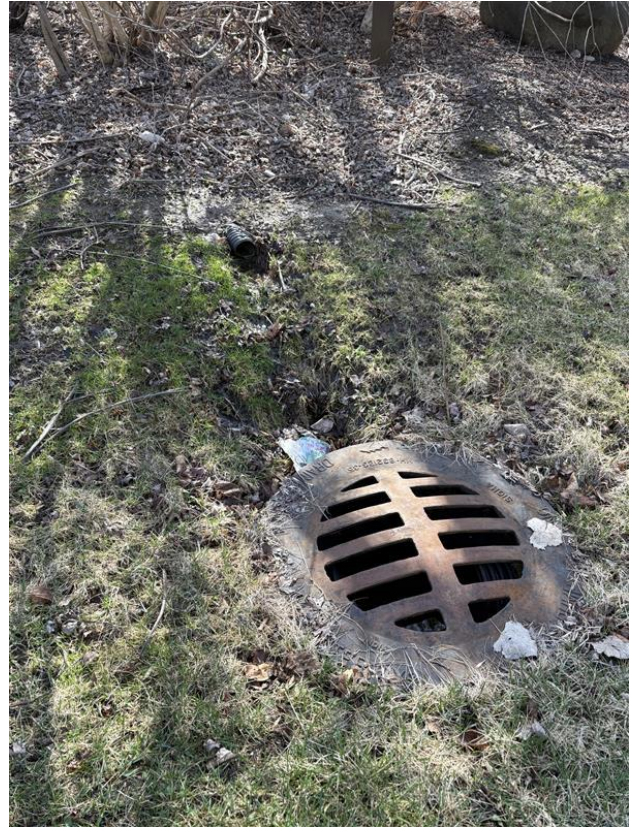
Lee Avenue – Utility Drain