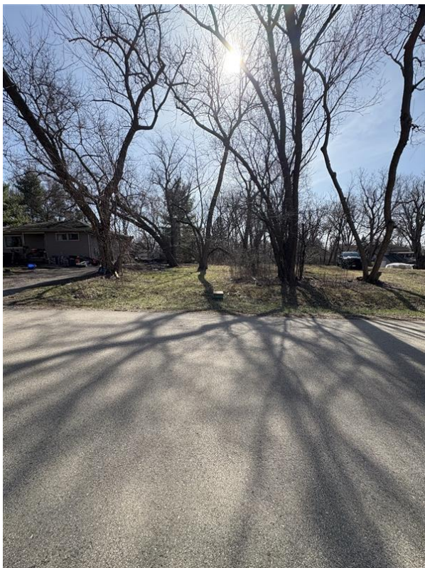
Dewey St – Looking Southeast