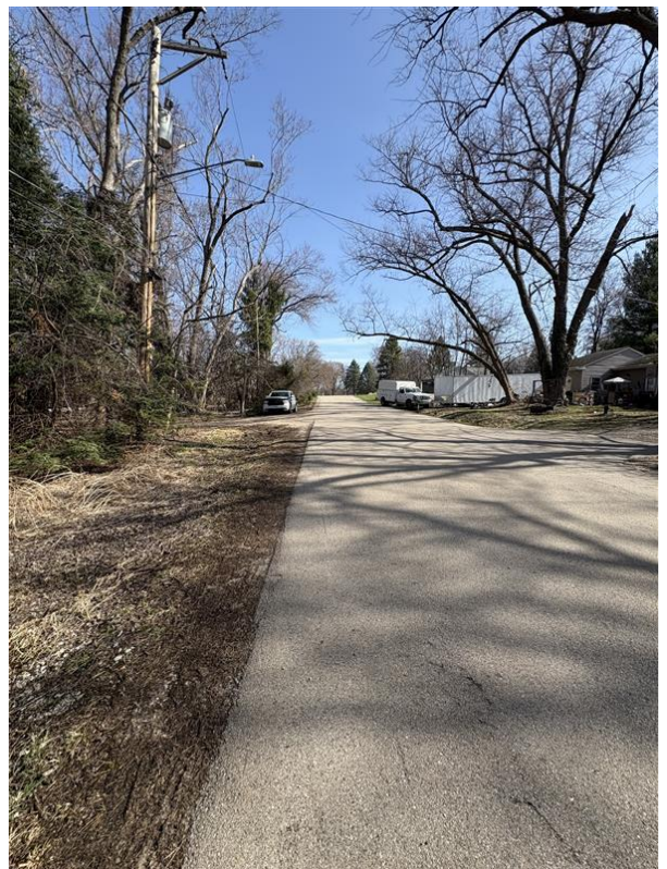
Dewey St – Looking Northeast