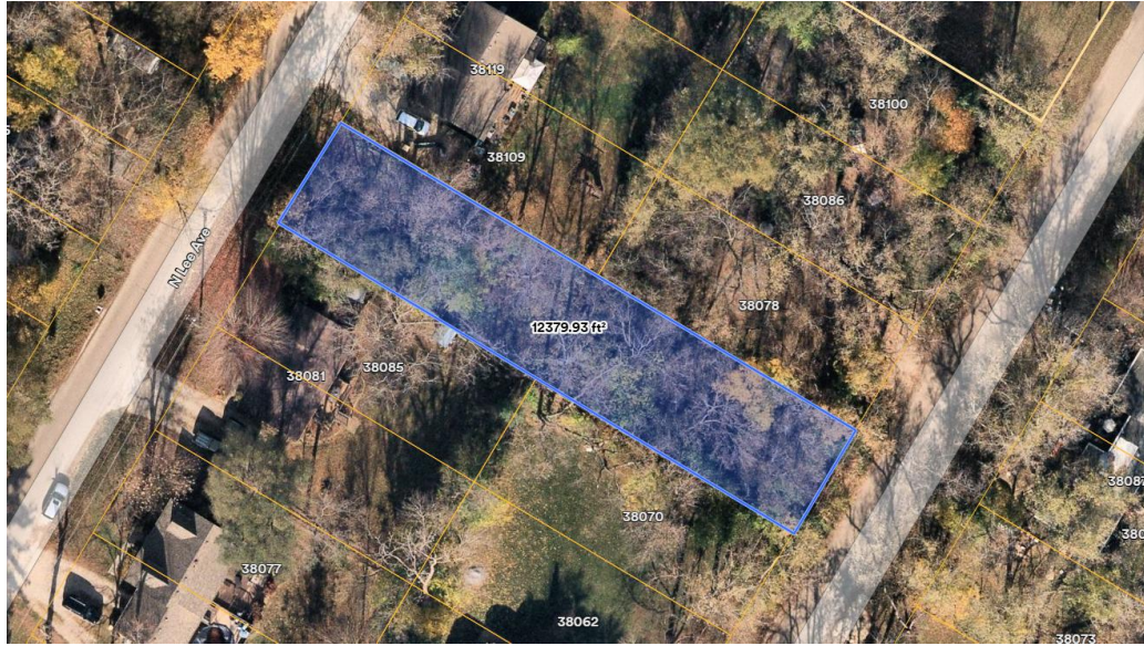
Aerial imagery of the vacation location.