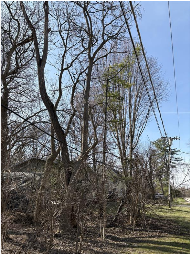
Lee Avenue – Utility Pole Facing South