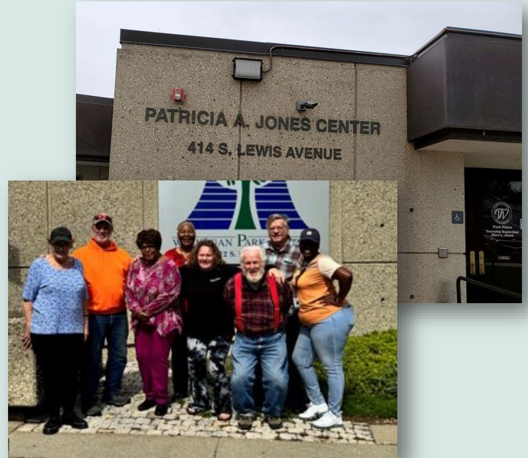
Member Spotlight - Patricia A. Jones Center