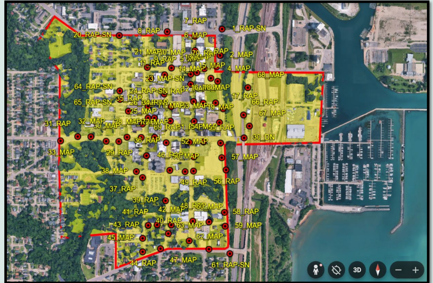
Mock-up of Waukegan Public Wi-Fi Network