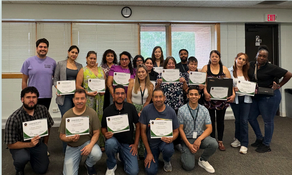
Round Lake Area Public Library Cohort 4 – Spanish Led Instruction