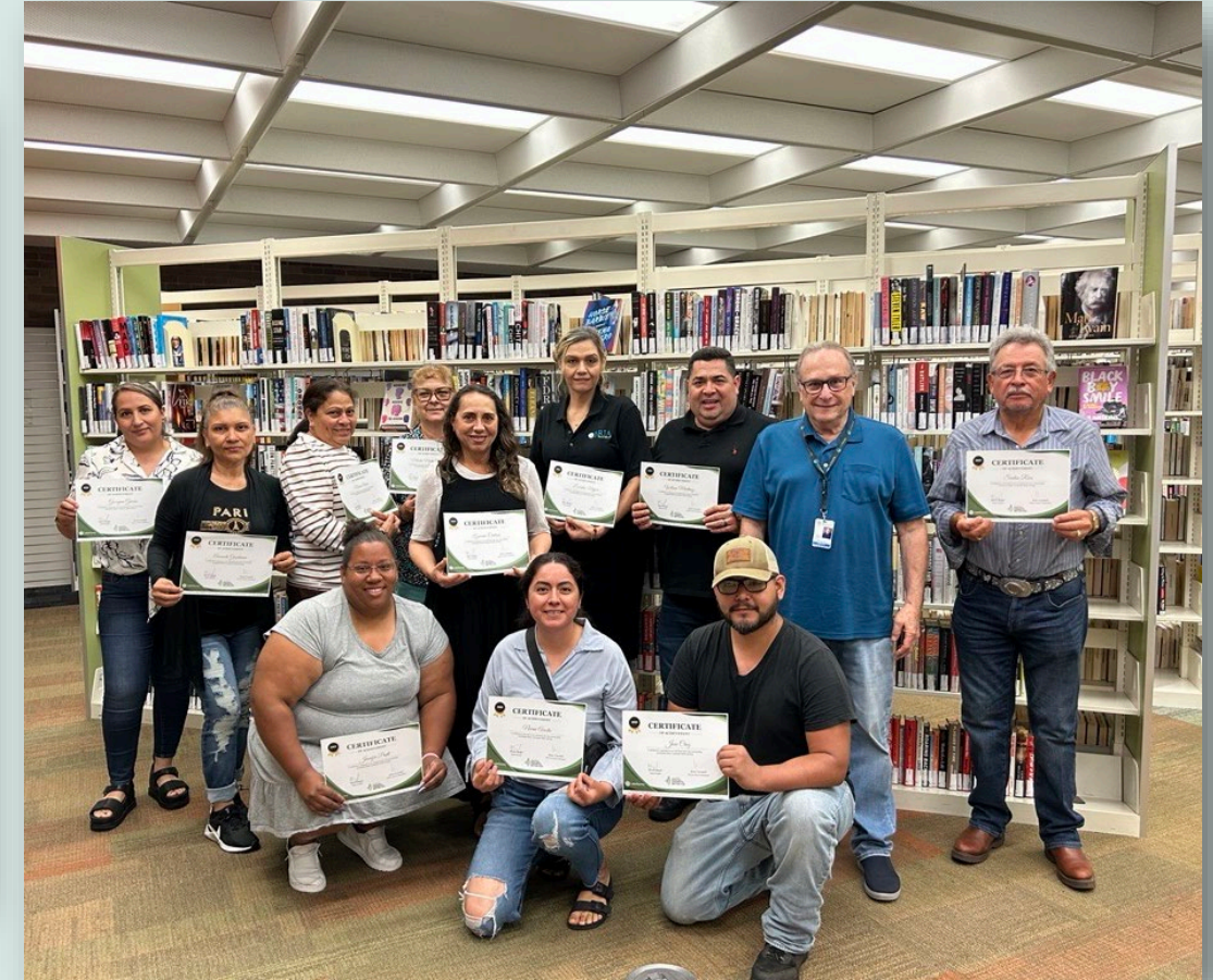
Waukegan Public Library Cohort 2 – English Led Instruction