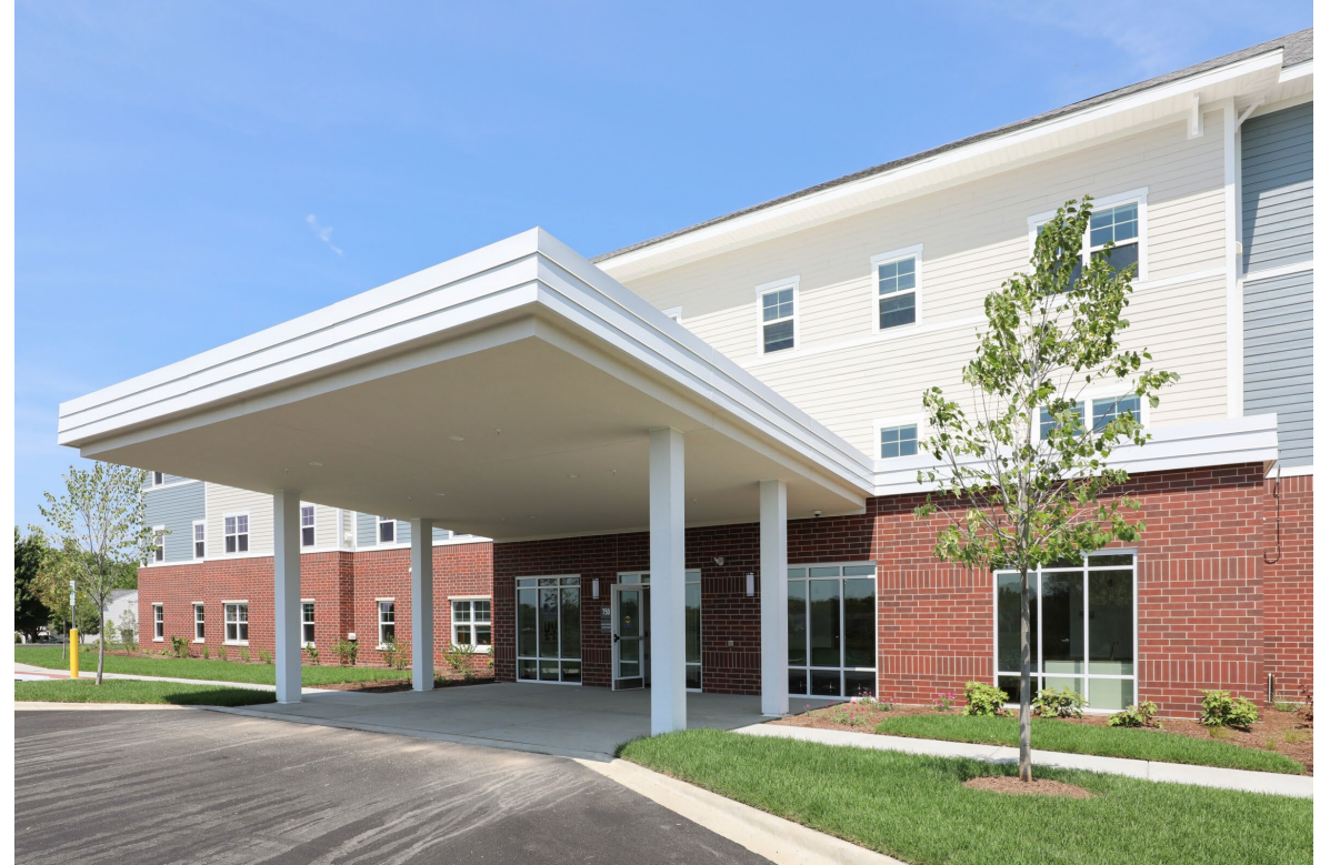
750 Tower Dr., Lake Villa