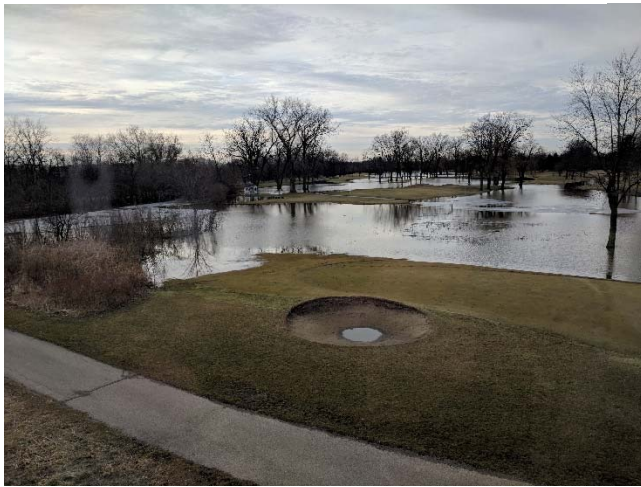
Potential Wetland Restoration Area (February 2018)