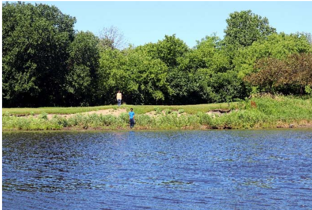
North Pond Shoreline