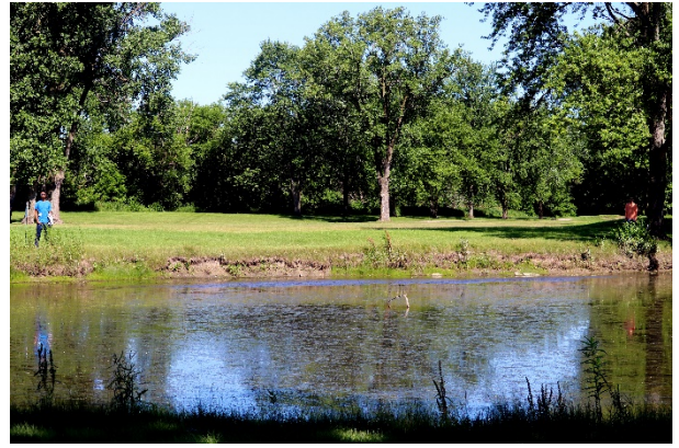
South Pond Shoreline