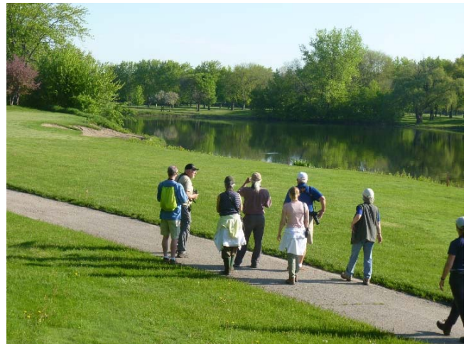
Potential for Wetland Buffer Plantings and Community Outreach