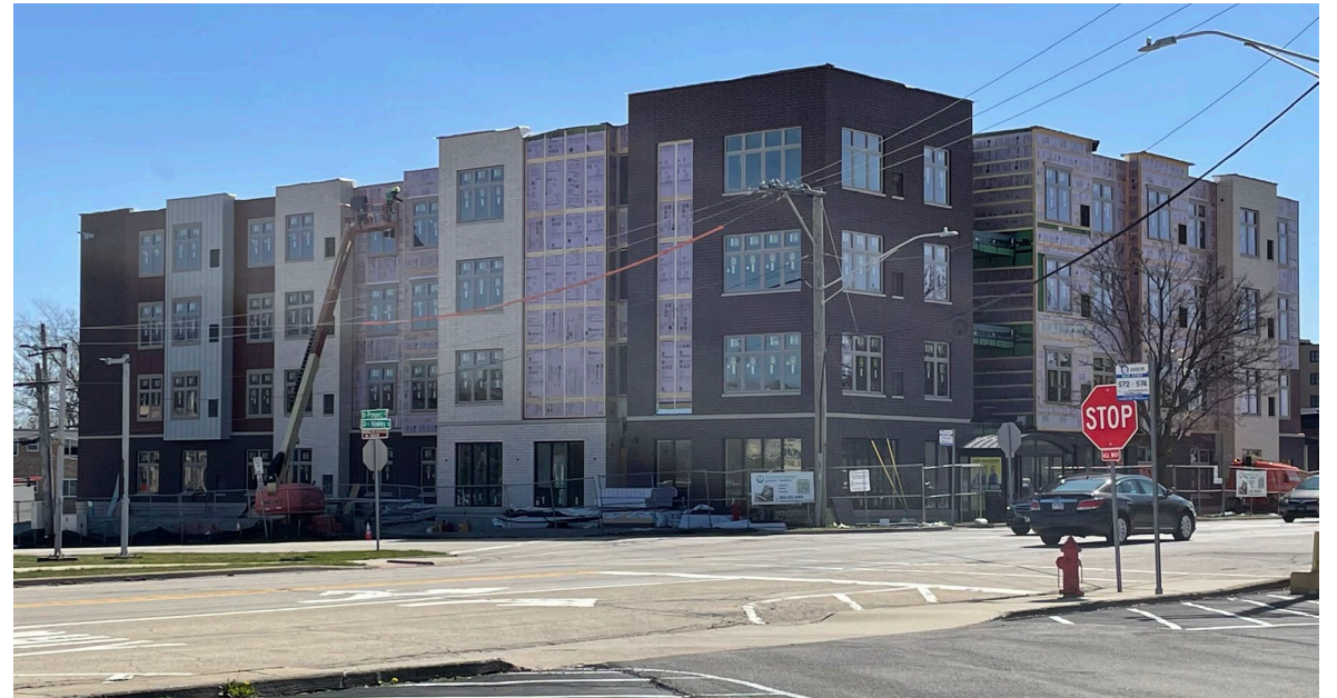
Mundelein Senior Apartments, currently under construction