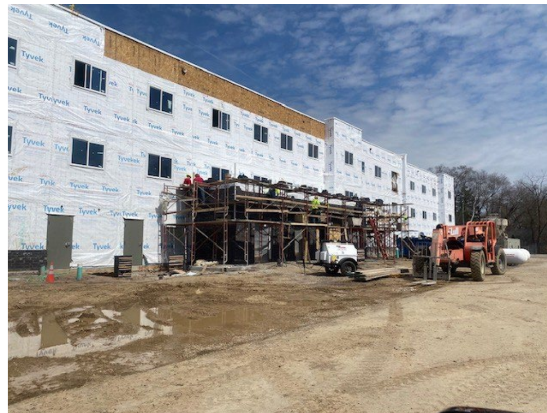
Beech St. Senior Apartments – Island Lake, IL