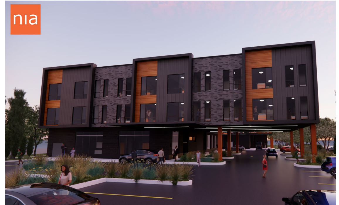
Eve B. Lee Senior Apartments – Libertyville, IL