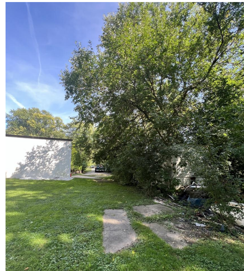
Unimproved Cherry Lane – Looking East