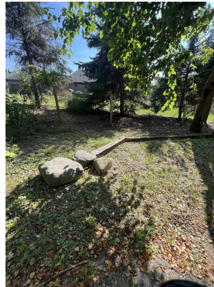
Unimproved Cherry Lane – Looking South