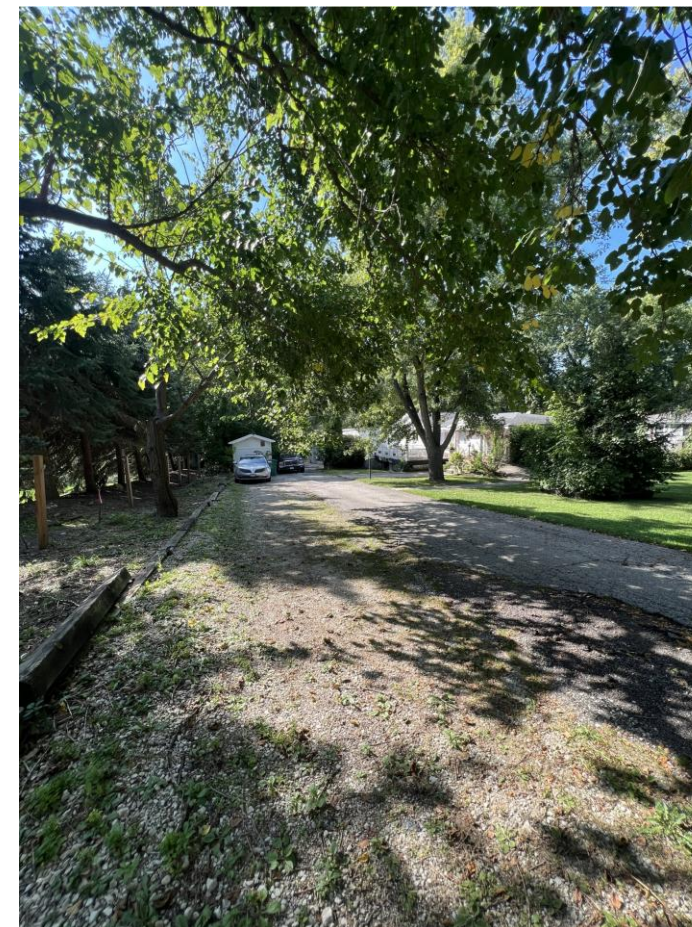
Unimproved Cherry Lane – Looking West