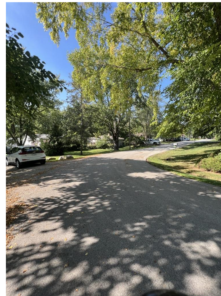
Unimproved Cherry Lane – Looking North