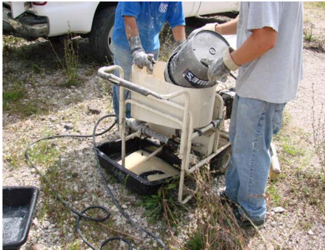
Oxygen Release Compound is mixed to a slurry for injection into contaminated soil and groundwater