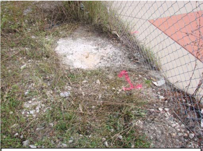
Completed underground injection probe area