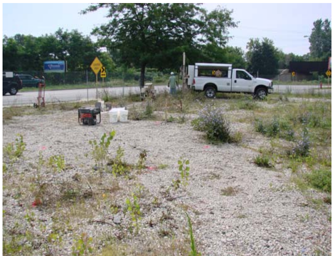
1812-20 Sheridan Road Remediation work in progress