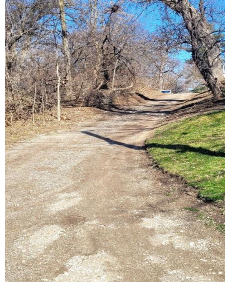
Klondike & High St. – Looking North