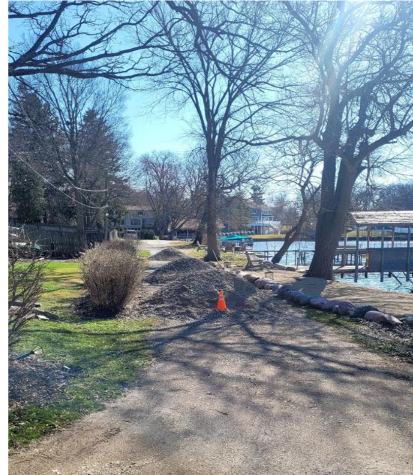
Klondike Ave. – Looking East