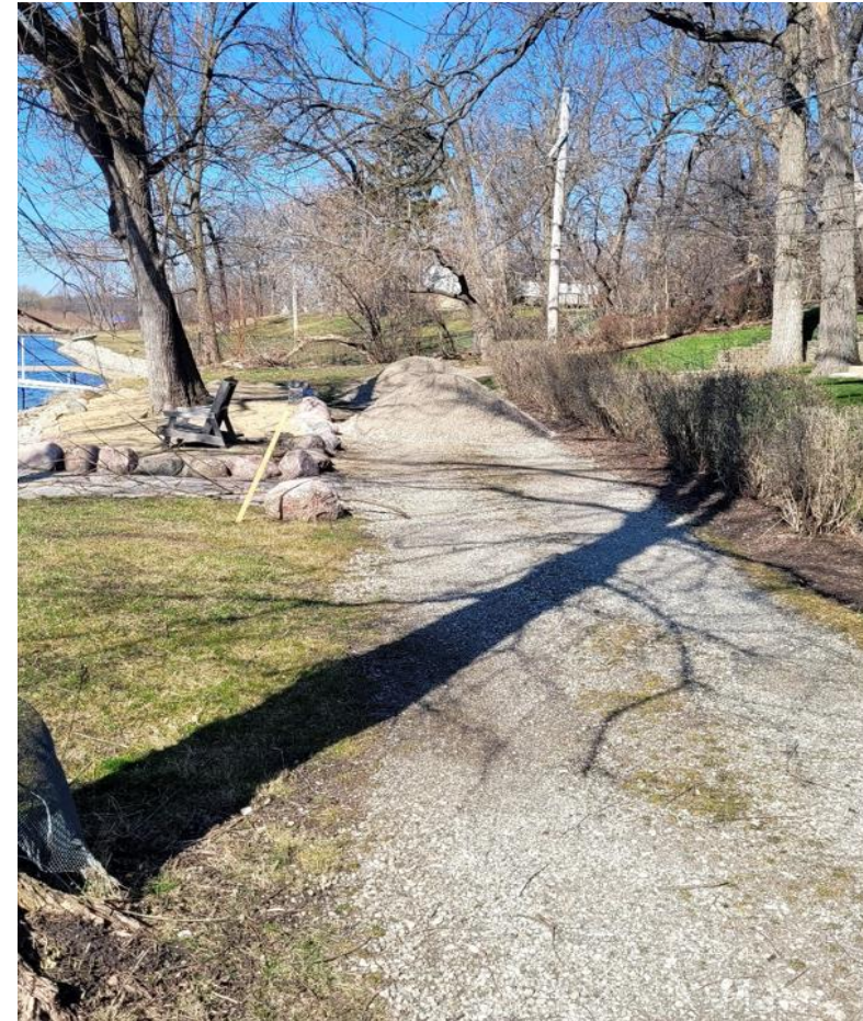
Klondike Ave. – Looking West