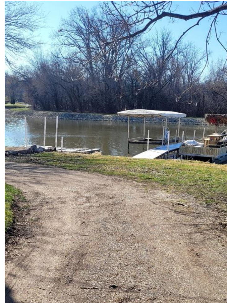
Klondike Ave. – Looking South