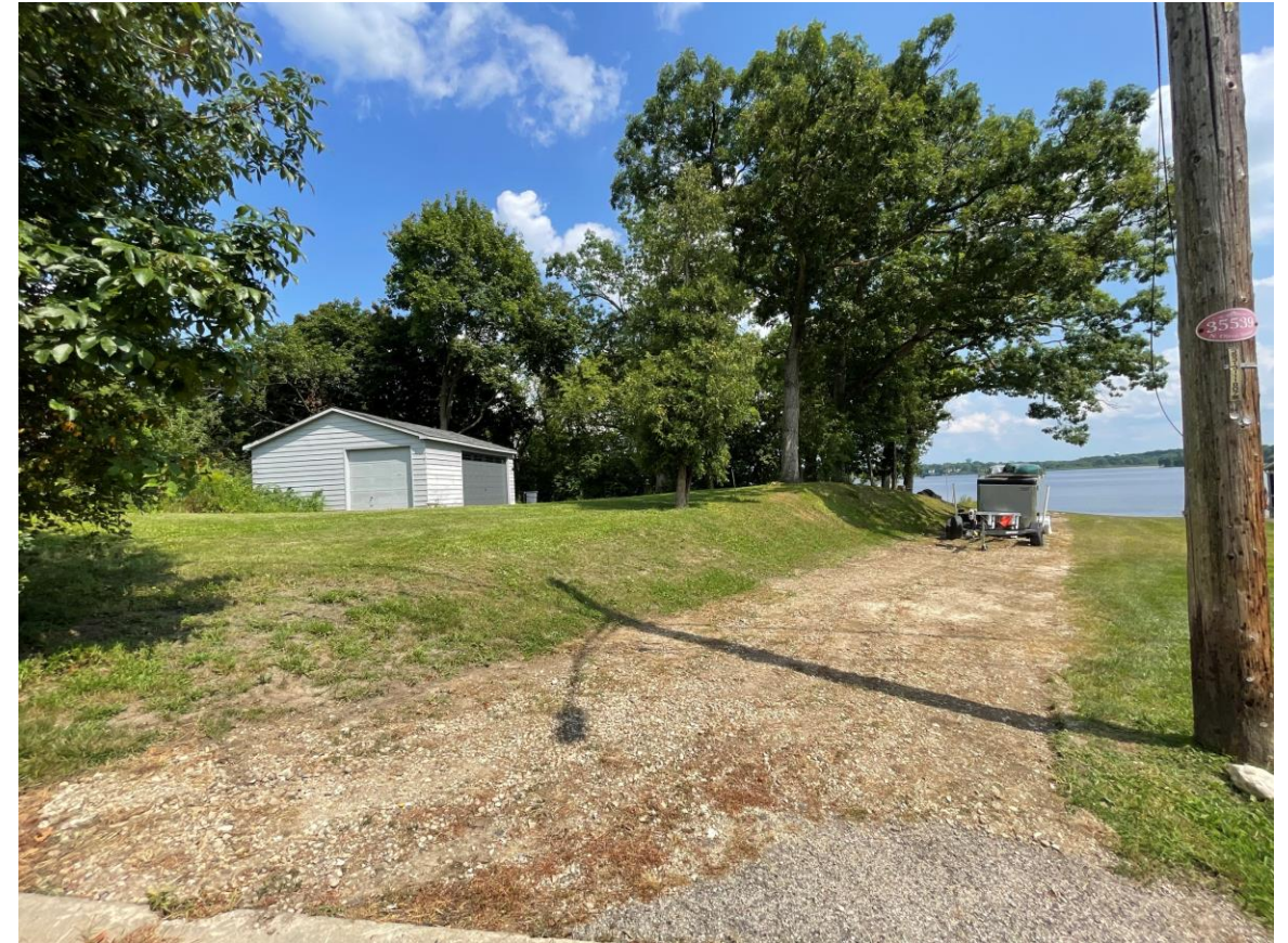
Olive St. – Looking East