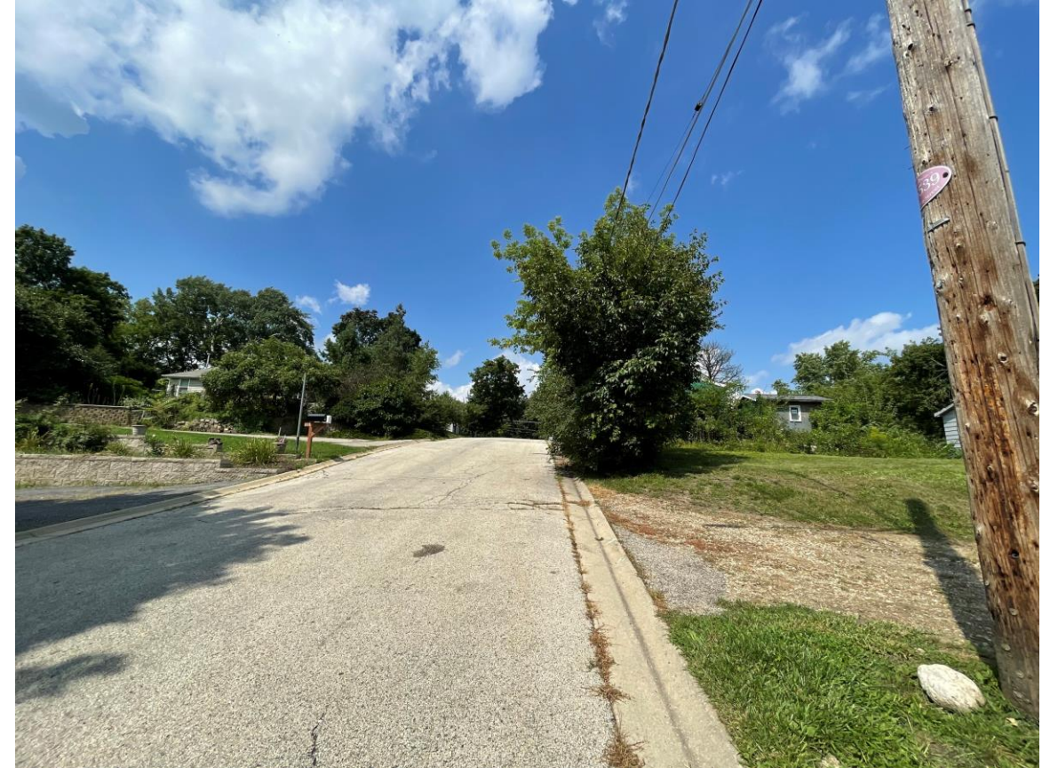
Olive St. – Looking North