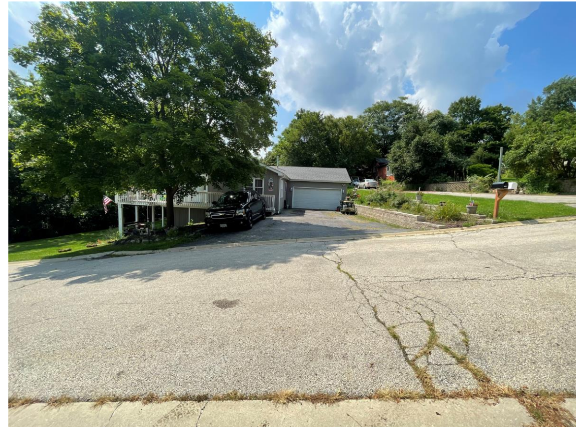
Olive St. – Looking West