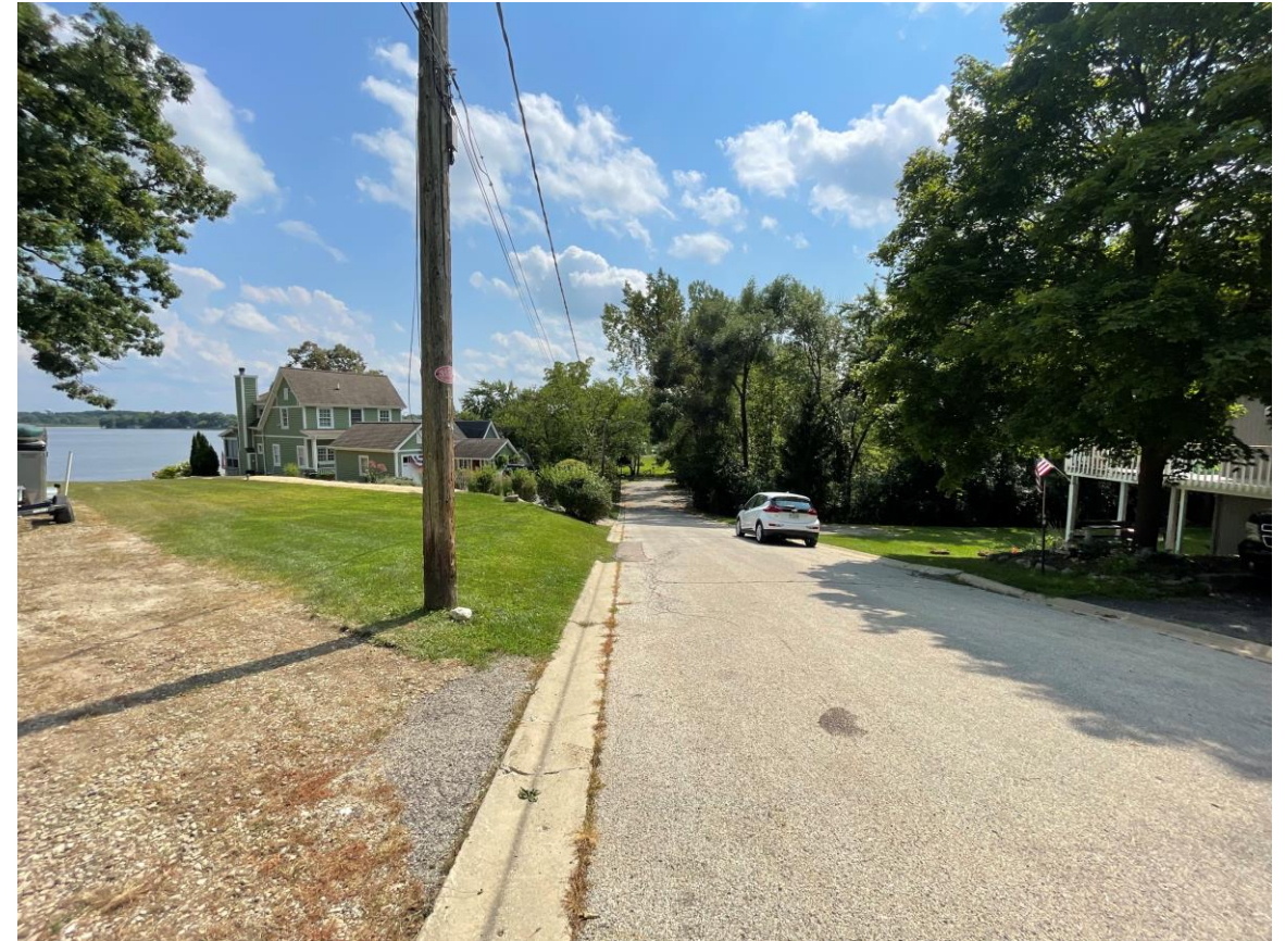
Olive St. – Looking South